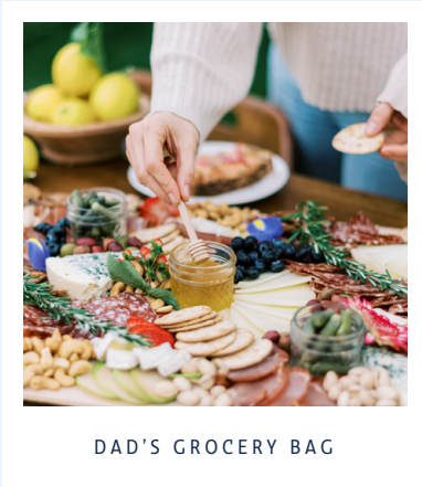
DAD'S GROCERY BAG